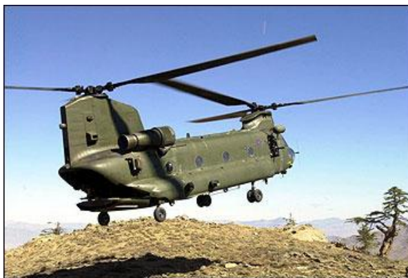
Chinooks are used to transport troops and supplies

The violence is rising despite the presence of nearly 50,000 foreign troops led by Nato and the US military as well as about 100,000 Afghan security forces.