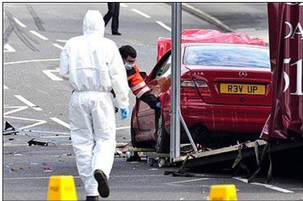
Distinctive... car licence plate.