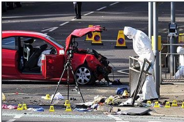
Smashed... front of Merc.