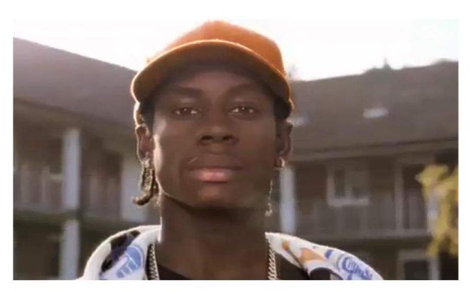
► YOU ARE POWERFUL